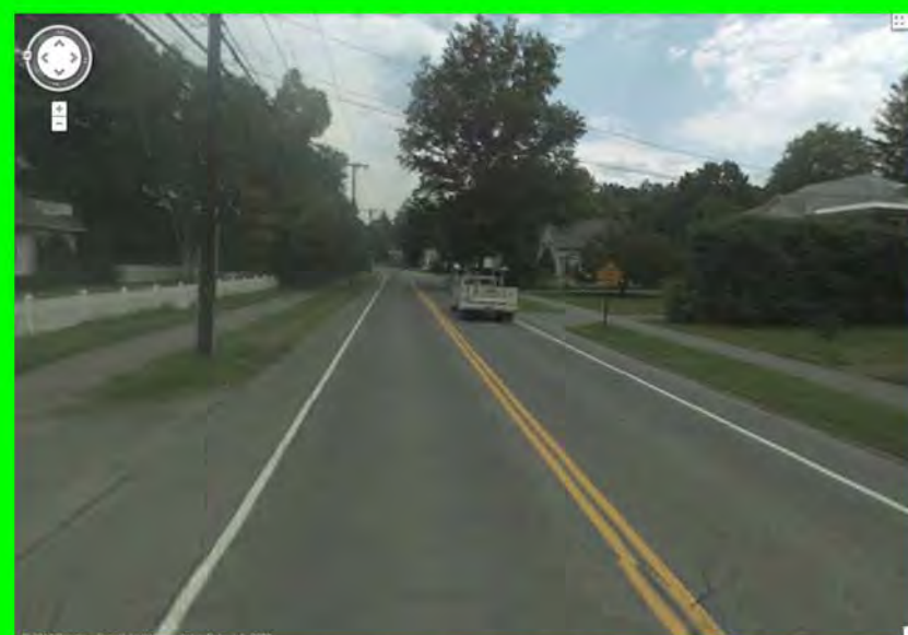
Bank Street (2009)