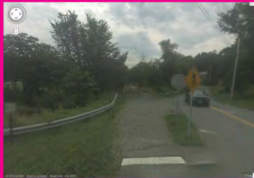
Northern Rail Trail (Google Street View - 2009)