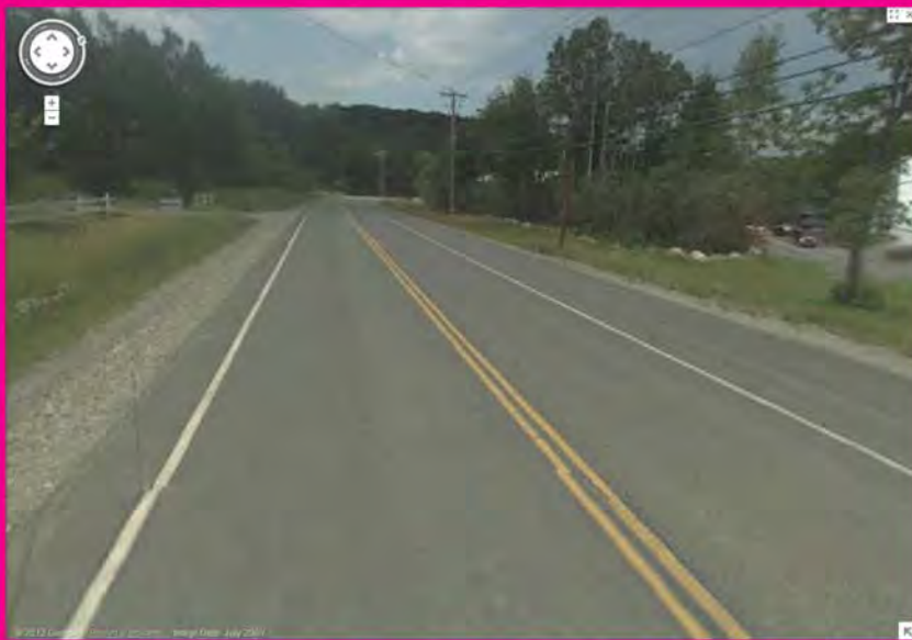
US Route 4 (Google Street View - 2009)