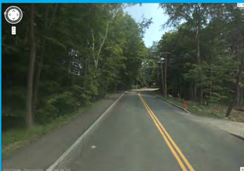
Prospect Street