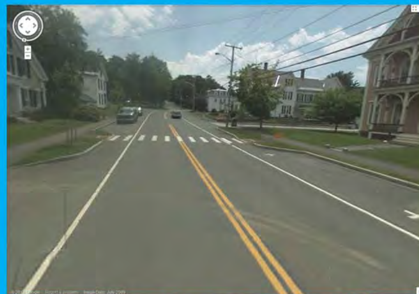
School Street