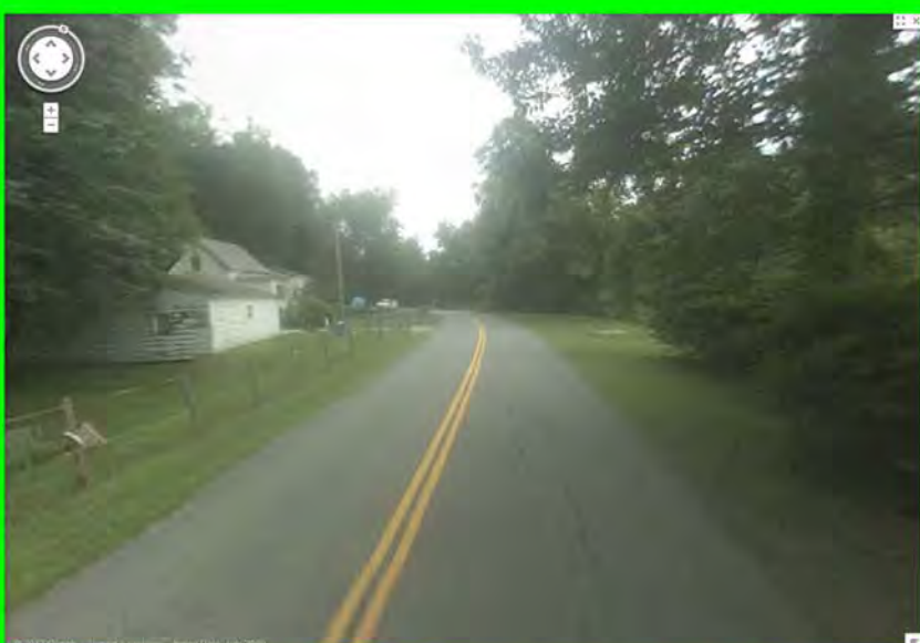
Pumping Station Road (Google Street View - 2009)